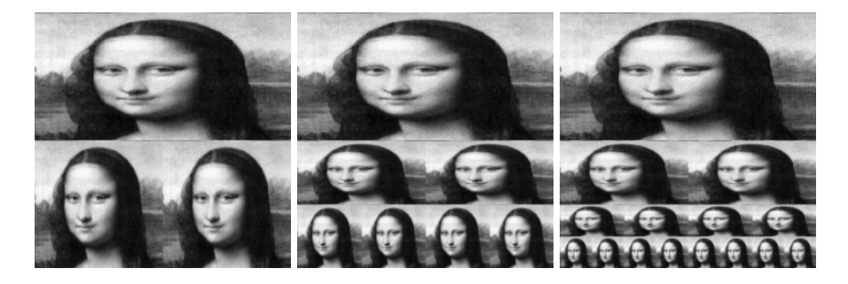
Figure 3: Bottom splits with n = 1, 2, and 3.