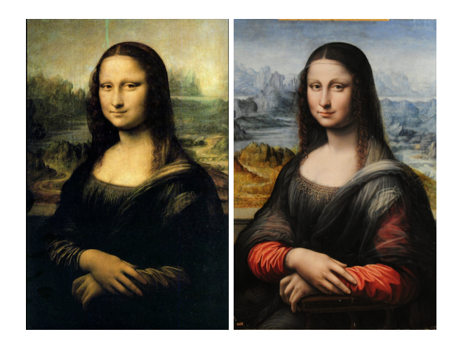
Figure 1: The Louvre Mona Lisa (left) and the Prado Mona Lisa (right).

stands for hue , S for saturation , and I for intensity . We will study color at length later in the semester, for now, it suffices to know that a color image can be decomposed into its HSI component images using the function color-image —> hsi , and that HSI component images can be used to construct a color image using the function hsi—> color-image .