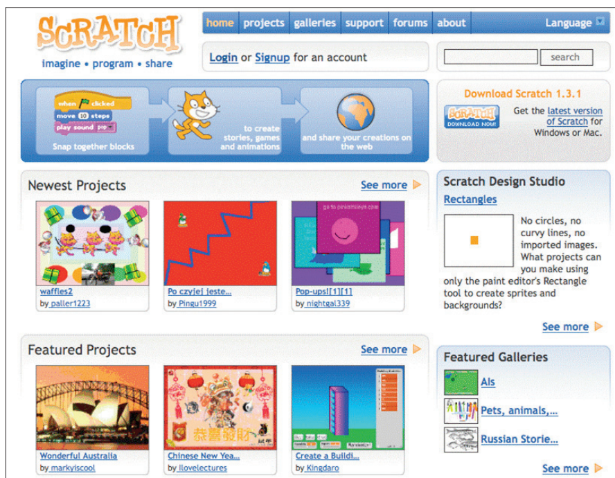
Figure 6. Scratch Web site.