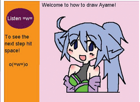
Figure 1. Screenshots from BalaBethany's anime series, contest, and tutorial.

She periodically added new characters to her series and at one point asked why not involve the whole Scratch community in the process? She created and uploaded a new Scratch project that announced a “contest,” asking other community members to design a sister for one of her characters (see Figure 1). The project listed a set of requirements for the new character, including “Must have red or blue hair, please choose” and “Has to have either cat or ram horns, or a combo of both.”