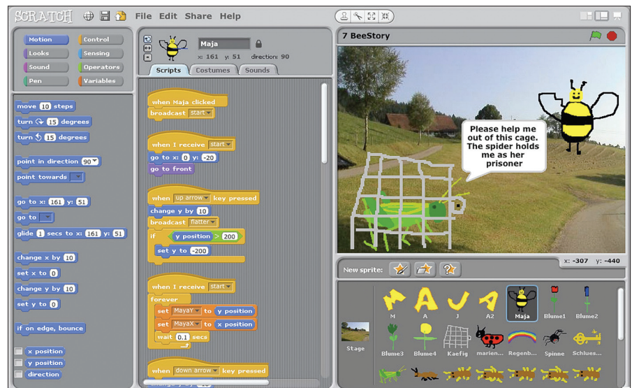
Figure 3. Scratch user interface.

The emphasis on iterative, incremental design is aligned with our own development style in creating Scratch. We selected Squeak as an implementation language since it is well-suited for