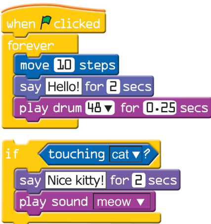
Figure 2. Sample Scratch scripts.

When personal computers were first introduced in the late 1970s and 1980s, there was initial enthusiasm for teaching all children how to program. Thousands of schools taught millions of students to write simple programs in Logo or Basic. Seymour Papert’s 1980 book Mindstorms 13 presented Logo as a cornerstone for rethinking approaches to education and learning. Though some children and teachers were energized and transformed by these new possibilities, most schools soon shifted to other uses of computers. Since that time, computers have become pervasive in children’s lives, but few learn to program. Today, most people view computer programming as a narrow, technical activity, appropriate for only