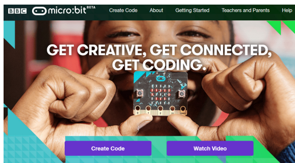
Figure 2: Official website with resources

asked to register with the BBC to request one free micro:bit per eligible child plus devices for their CS teachers. In September a small number of prototype micro:bits were made available to partners and selected teachers for trial and training purposes. A range of events were offered to train teachers. From March 2016, schools started to receive devices for teacher familiarisation and most schools received their full delivery between April and July 2016.