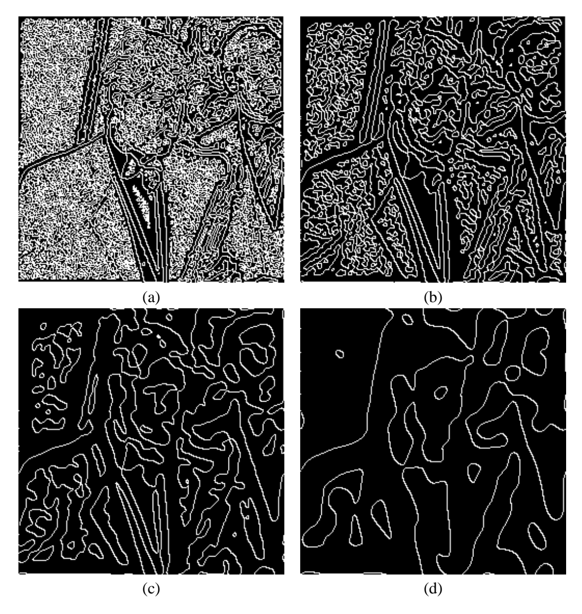
Figure 1: (a) Zero crossings of Laplacian of Gaussian ( \sigma = 1 ) for Bill Clinton image. (b) \sigma = 2 . (c) \sigma = 4 . (d) \sigma = 8 .